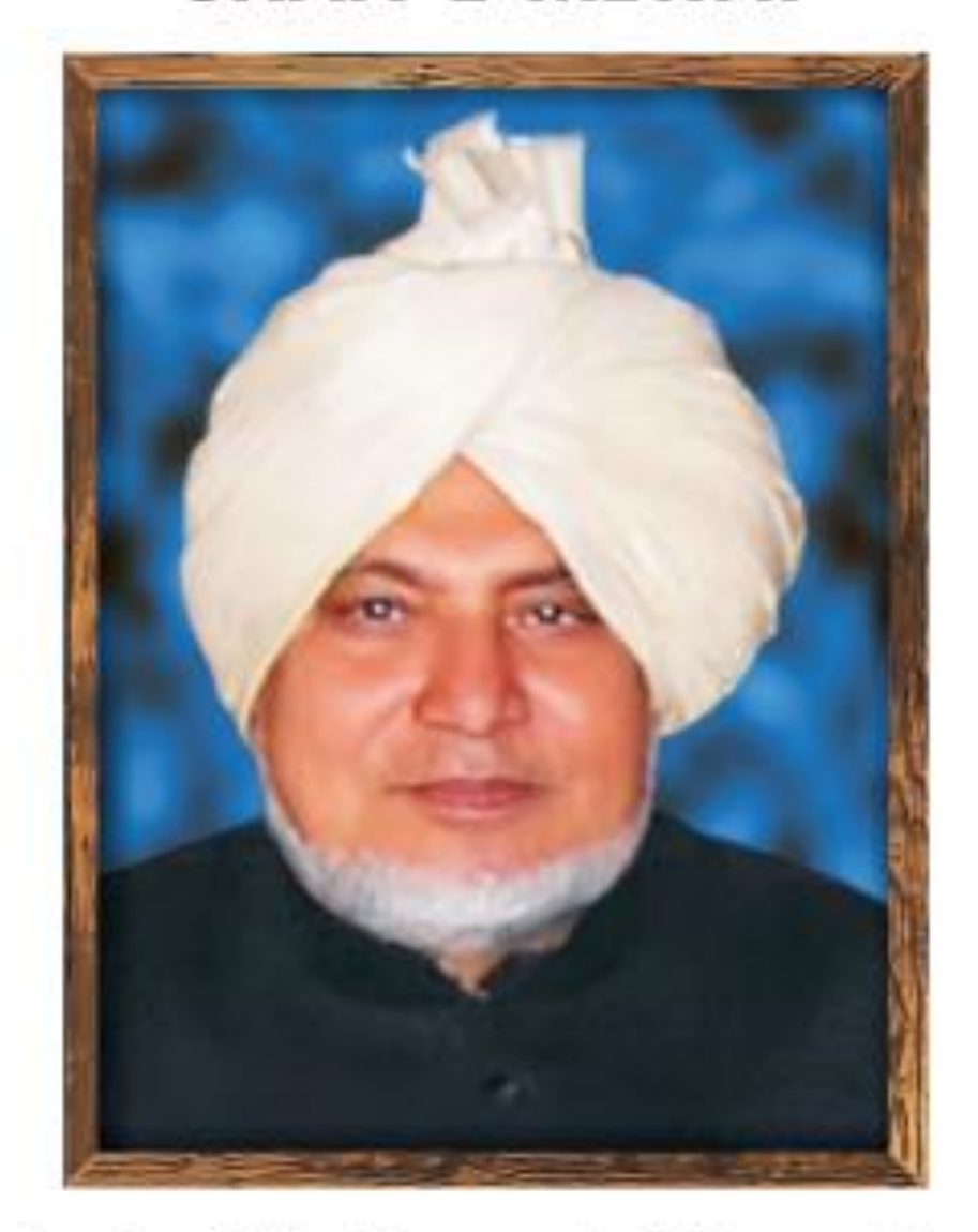
Late Ch. Tayyab Hussain Ex. M.P. & Ex. Minister